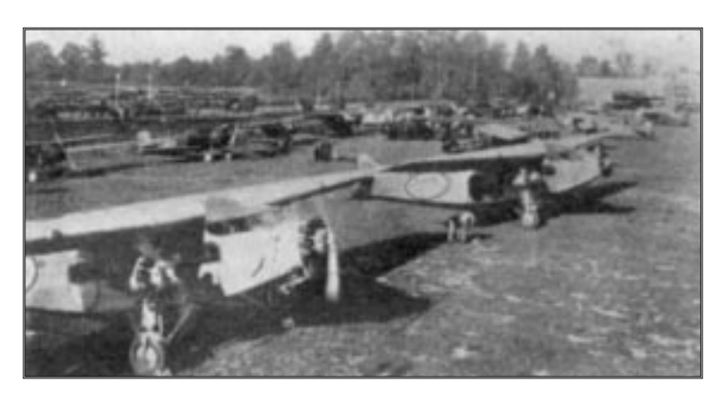
Contesting planes at the Ford Airport at the start.

We had lunch at Windsor and took off for Toronto, which was to be our first night stopover. The take-off here, as at all succeeding noon control points, was in order of arrival that is, first in, first out. From night control points, on the other hand, the order of take-off was reversed: last in, first out. This method was used thruout the Tour, with the exception