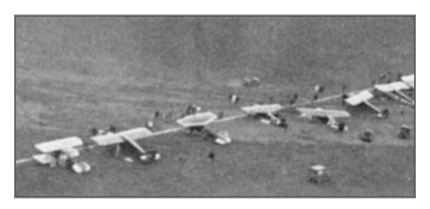
On the line at Roosevelt Field.