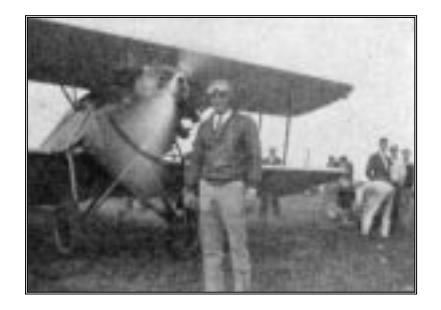
"We" at Des Moines

Thursday morning we took off for St. Joseph, Mo., and I was warmed up by the fact that we were heading back up for my home country. The weather man also provided for this warming up business that day. A slight tail wind and the balmy air made the day pleasant for the 192-mile flight to St. Joe and the