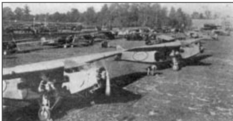
Contesting planes at the Ford Airport at the start.

We had lunch at Windsor and took off for Toronto, which was to be our first night stopover. The take-off here, as at all succeeding noon control points, was in order of arrival that is, first in, first out. From night control points, on the other hand, the order of take-off was reversed: last in, first out. This method was used thruout the Tour, with the exception