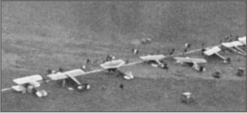
On the line at Roosevelt Field.