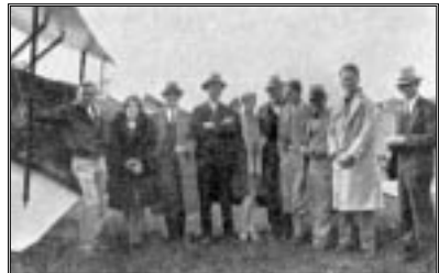
The gang from our Monmouth Field met me at Moline.

Sunday morning when we left Milwaukee for Moline, there was a slight drizzle at the start, but I experienced no trouble in covering the 174-mile hop. At Moline I had another pleasant reception from the