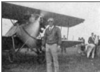
"We" at Des Moines

Thursday morning we took off for St. Joseph, Mo., and I was warmed up by the fact that we were heading back up for my home country. The weather man also provided for this warming up business that day. A slight tail wind and the balmy air made the day pleasant for the 192-mile flight to St. Joe and the