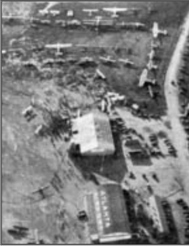
The half-way point — Atlanta.